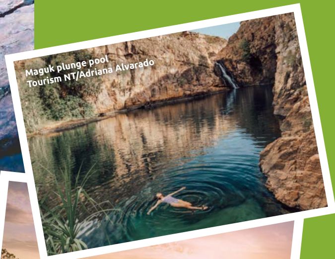
Maguk plunge pool