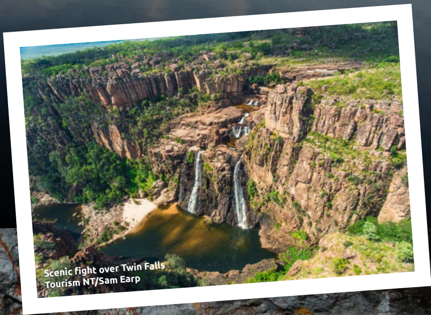
Scenic flight over Twin Falls