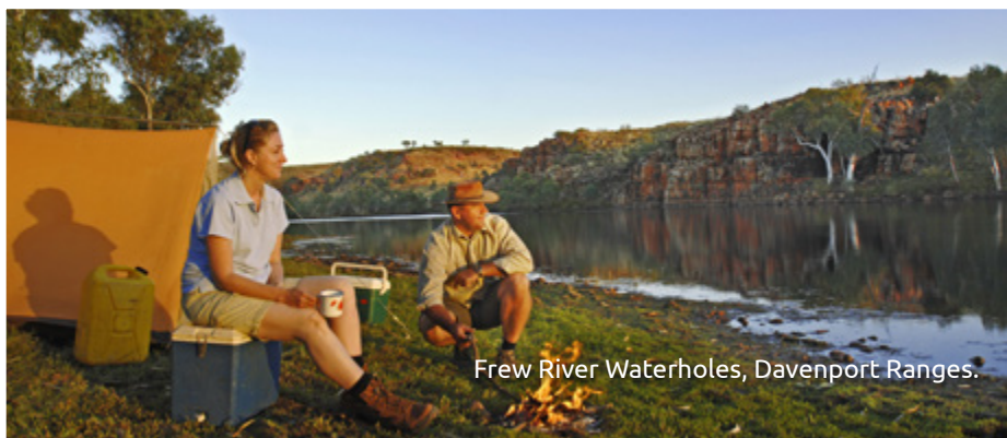
Frew River Waterholes, Davenport Ranges.

powered or unpowered caravan and camping site, or in a cabin. Try your luck fossicking for semi-precious stones such as zircons and red garnets.