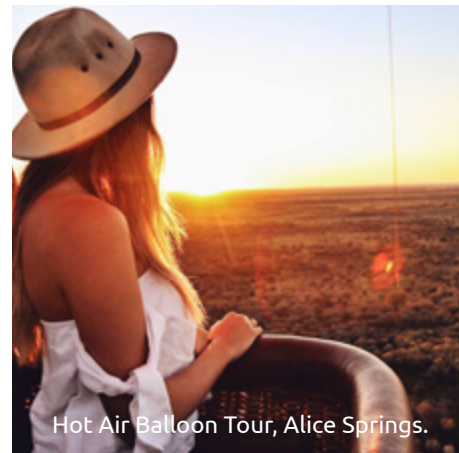
Hot Air Balloon Tour, Alice Springs.