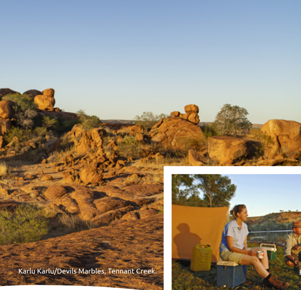
Karlu Karlu/Devils Marbles, Tennant Creek.