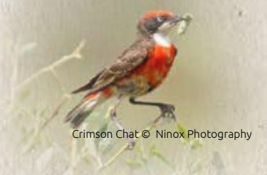
Crimson Chat