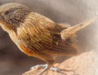
Dusky Grasswren