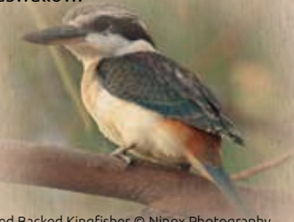
Red Backed Kingfisher