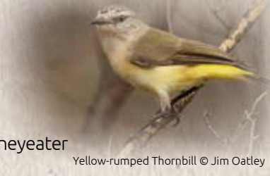
Yellow-rumped Thornbill