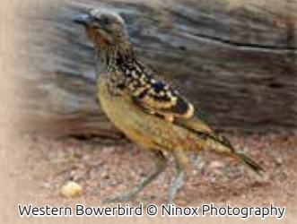
Western Bowerbird