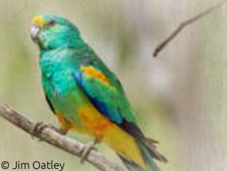
Mulga Parrot