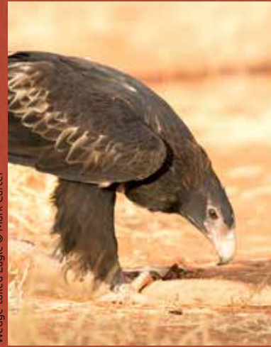
Wedge-tailed Eagle

Alice Springs and its surrounding area is a fantastic birding destination. The desert landscape of Central Australia is home to 180 bird species in a range of spectacular habitats from sandstone