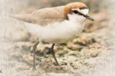
Red-capped Plover

*Access to this site is conditional. All visitors must contact Tourism Central Australia for a list of accredited guides who can facilitate entry. Costs may apply.