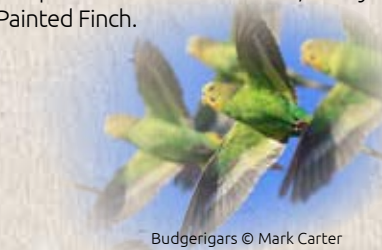
Budgerigars