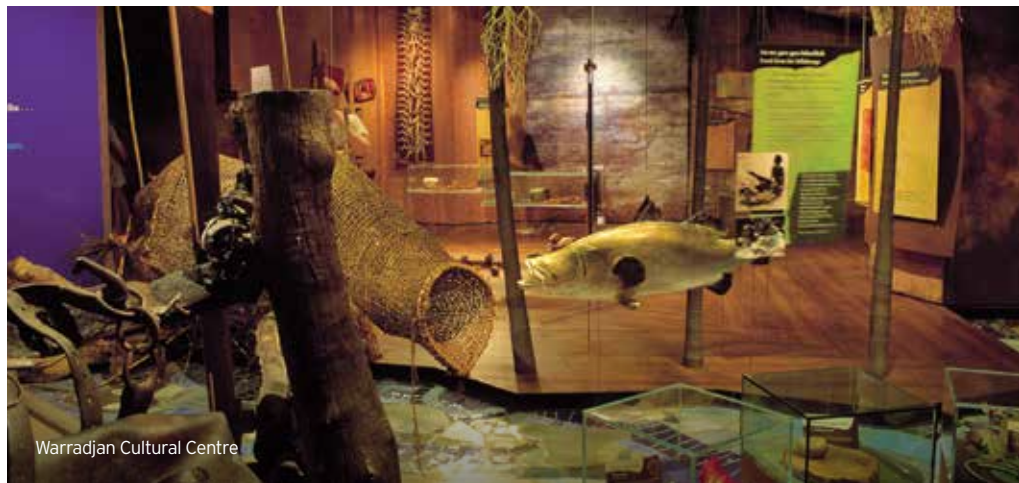
Warradjan Cultural Centre