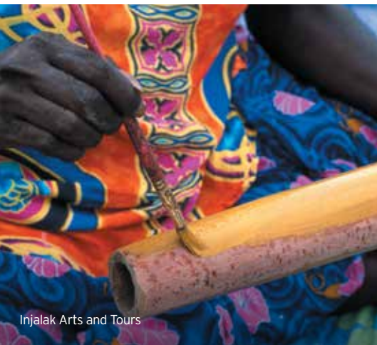
Injalak Arts and Tours